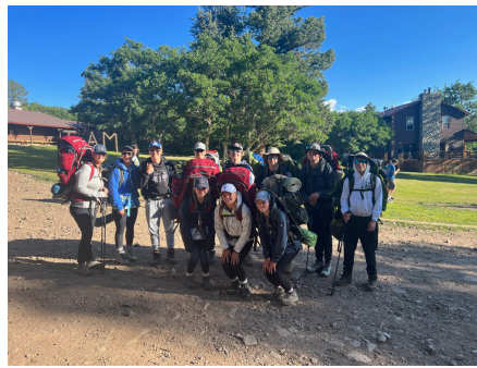
Newsletter cover picture is the peak picture from the trip as well!